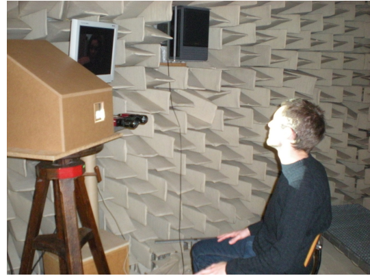
Figure 2: Recording setup: one speaker sits in front of the 3D scanner in the anechoic room while watching a video for instructions on the screen.

Warping the generic template to the reconstructed 3D model is achieved by means of non-rigid registration, where for each mesh vertex v_i of the generic template a deformation vector d_i is determined in addition to a global rigid alignment. This is formulated as an optimization problem, consisting of a smoothness term minimizing bending of the underlying deformation (Botsch and Sorkine, 2008), and a set of data constraints minimizing the distance between the warped template and the reconstructed model. As the vertex correspondences between generic template and reconstructed model are unknown, closest point correspondences are used as approximation similarly to standard rigid iterative closest point registration. A set of manually labeled correspondences are used for the initial global alignment and to initialize the warping procedure. The landmarks are mostly concentrated around the eyes and mouth, but a few correspondences are selected on the chin and forehead to match the global shape. The manual labeling needs to